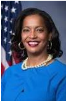
Rep Jahana Hayes (D-CT)

117 th CONGRESS January 3, 2021 to January 3, 2023 https://cawp.rutgers.edu/women-in-117th-congress