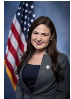
Rep Abby Finkenauer (R-IA)

117 th CONGRESS January 3, 2021 to January 3, 2023 https://cawp.rutgers.edu/women-in-117th-congress