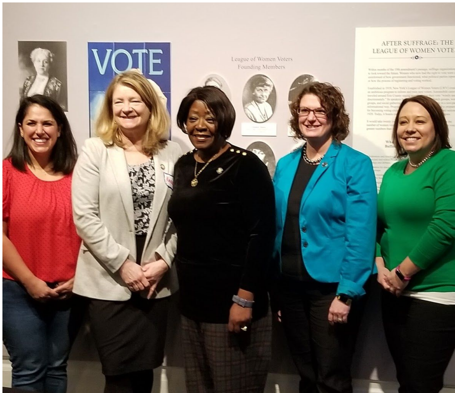
WNY Women in Elected Office, 2020